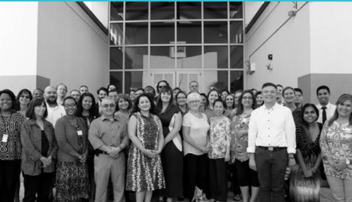
Faculty Orientation August 2016